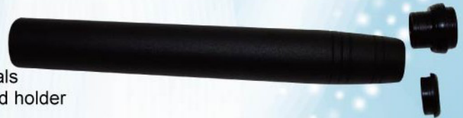
Slim Slick Butt